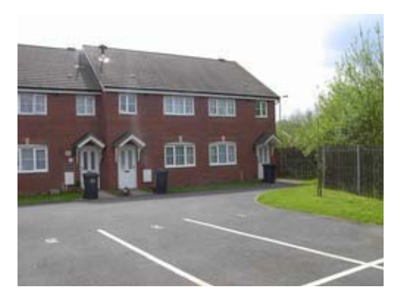
Affordable housing can fit in with other houses and look attractive.

8.13 Surface water flooding happens every time there is heavy rain for more than one hour or prolonged medium rain. In some cases the storm drains are inadequate, but all flooding should be reported to the Parish Council who will pass the information on to the Highway Authority via the Local Area Office. The regular flood at the junction of Kidmore Lane and Hambledon Road, which is on a minor crest, is an example of damaged drains. The flooding in Southwick Road (C40) close to the entrance to the recreation ground is due to over-laden drains. The flood takes up to an hour to clear after rain ceases. Flooding is also a regular feature on Fareham Road - often but not always due to the drains from the road to the ditches not being kept clear. All the surface water flooding creates a hazard to all road users.