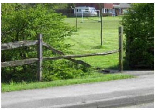
Post and rail fencing leaving the Parish Council with a high maintenance cost.