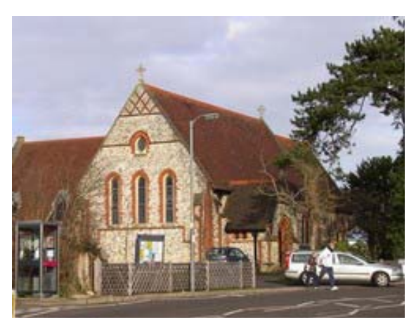
The village church showing the knapped flint and brick quoin construction typical of many of the older buildings.