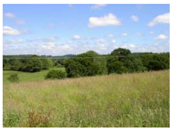
The closest trees mark the course of the West going stream close to World's End. There are remnants of water meadows above and below this point.

times there were three areas in which water-meadows were a valuable commodity to the farmers. Two of these were in the vicinity of World's End and one approximately in the Anmore area. Traces of the sluices connected with these meadows are still visible.