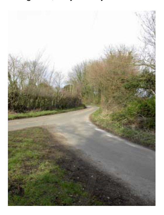
Lanes in Denmead countryside tend to be narrow, twisty and without footways. The few lanes made as part of the 19th century enclosure process are straight and with ditches.

Denmead has 1 'B' road, 3 'C' roads and a number of 'U' lanes. During its progress through the parish the B2150, Hambledon Road has a 30mph limit. About half its length has a pavement on one side, about a quarter a pavement on both sides and a quarter with no pavement. There is one light controlled pedestrian crossing. A cycle way has been created from the roundabout on the eastern edge of the village to the Parish Boundary with Waterlooville. Lanes in Denmead are without footways, rarely more than 1 vehicle wide and frequently without verges or ditches. There are a few miles of unmetalled lanes which are either overgrown, very muddy or both.