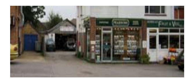
Businesses set in behind the shops.

3.8 A District Council free car park with public toilets has also been provided on this side of the road at the East end of the centre at the junction with Kidmore Lane. This is a popular meeting point for ramblers, cyclists and others wishing to explore the lanes and countryside in the parish and beyond. It is safeguarded by Policy 6 of the Neighbourhood Plan.