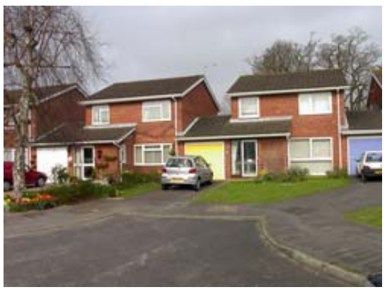
Link houses are another example of a 1970s development maximising ground use.

4.21 The Parish as a whole has only 56% of the recommended quantities of recreational spaces. Kidmore Lane and King George Playing Fields (including the additional land not belonging to the charity) are well equipped but over used. Moreover the Kidmore Lane field has drainage problems (on a spring line) which limits its use in winter.