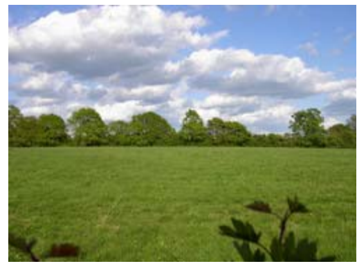
Pastures and trees were high on the list of 'most popular view' in a residents survey – although which specific view differed enormously.