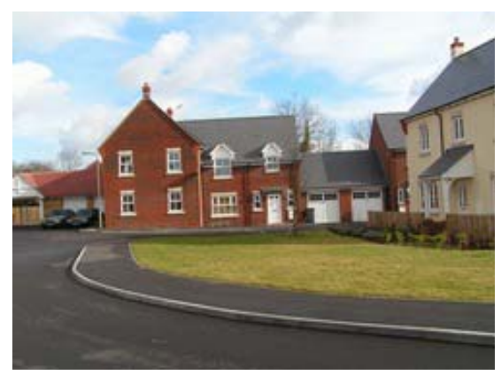
A modern infill development where quality of life has not been neglected. The spacing provides both room for children's informal play and a pleasant environment for adults.

old peoples' homes are to be found. These blocks are so surrounded by other buildings they do not jar visually.