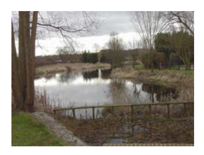
Willow Lake, World's End

due to a combination of spring lines (not all of which are in the lowest parts of the parish) and the high water table.