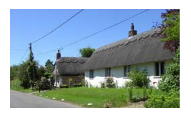
Closer to the road than most houses in the Denmead countryside this picture shows a well cared for dwelling.

Neighbourhood Plan evidence and is referred to in Policy 1: A Spatial Plan for the Parish. The area of the gap is marked on the included Map 2 Village Design Statement Area in Appendix 2.