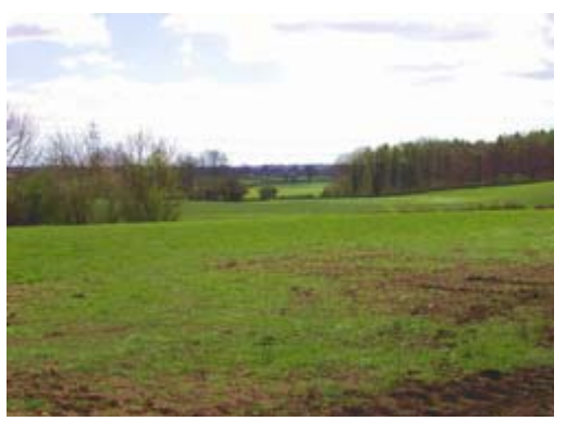
The view from Mayswell looking South towards the completely hidden village. This picture was taken from within a yard or two of the SDNP boundary.