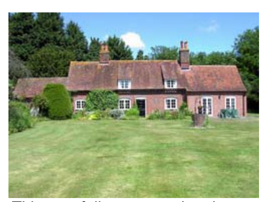
This tastefully renovated and extended building is in World's End