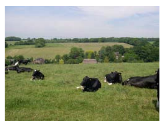
Cows to the North of the parish. The cows are in part of the SDNP close to the parish boundary. The view is looking North with Hambledon parish in the background.