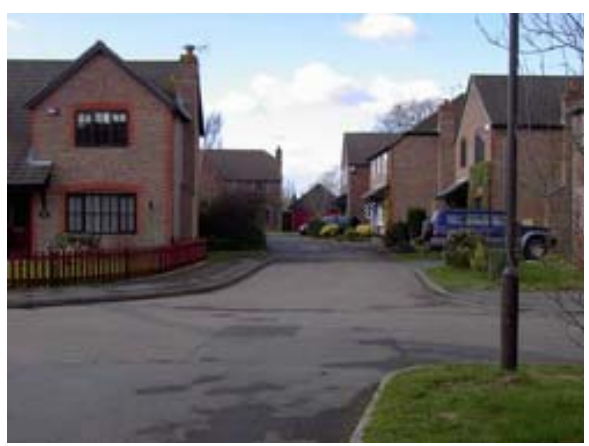
A back-fill development. Like many such estates there is a lack of children's play facilities.

4.5 This section covers that part of the parish which to many people constitutes Denmead and is within the policy boundary shown in the Neighbourhood Plan. Parts specifically excluded are those dealt with elsewhere namely the Village Centre and the Forest Road Development.