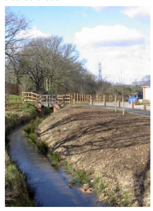
West going stream just to the west of Southwick Road

2.45 The common garden species such as Red Admiral, Peacock, Small Tortoiseshell, Comma and Holly Blue are frequent but variable in numbers from year to year. Creech Wood is rich in important butterflies including Purple Emperor and White Admiral, which are rare and classified as High Priority Species. Also seen at the top of oaks are Purple Hairstreaks. Other woodland species to be seen in Creech Wood are Silver Washed Fritillaries and Spotted Woods. Brimstones, Meadow Browns. Gatekeeper, Small Skipper, Large Skipper and Marbled Whites may be seen in the cleared areas.