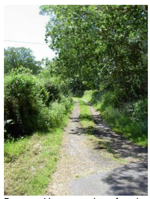
Denmead has a number of unclassified and un-metalled roads but there is a long walk before you can enjoy the pleasures of these lanes. This one is at Martins Corner.

8.5 There is only one cycle way. The greenways in the Forest Road development are not marked as available for use by cyclists.