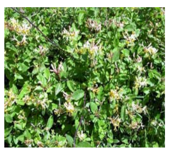
Honeysuckle in a World's End hedgerow