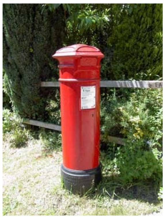
This post box, situated in Worlds End is a listed monument reflecting the age and past importance of the area.