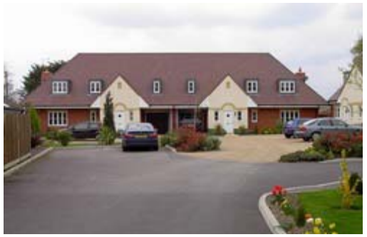
A modern but different approach to backfill development close to the village centre.