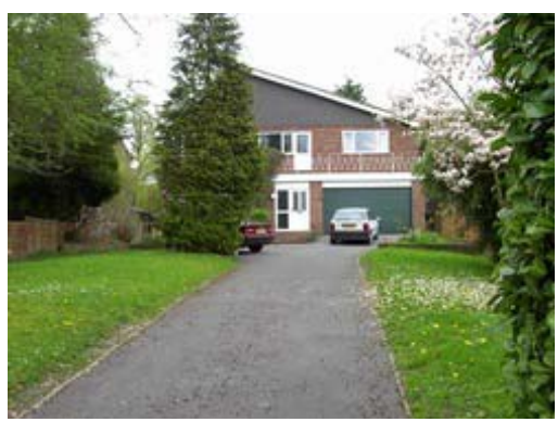
Older houses in the Anthill area are larger (and on bigger plots), than those closer to the village centre.

Street scene in the Anthill Common area. A quiet area with no pavements, little traffic, and generally larger houses on larger plots.