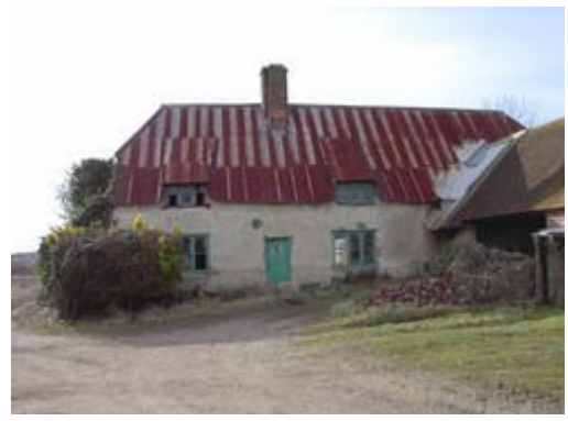
This derelict building had consent for renovation/conversion. The countryside benefits from such buildings brought back into use.