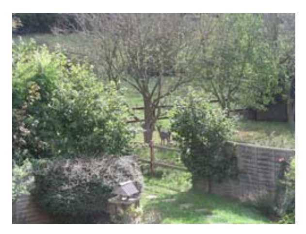
Deer are not the only wild animals to be seen to be seen in local gardens and open spaces within the village.